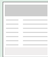
Left Column: Header with left column for short news stories or quick links.