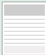
Header: Header graphic with text & images below